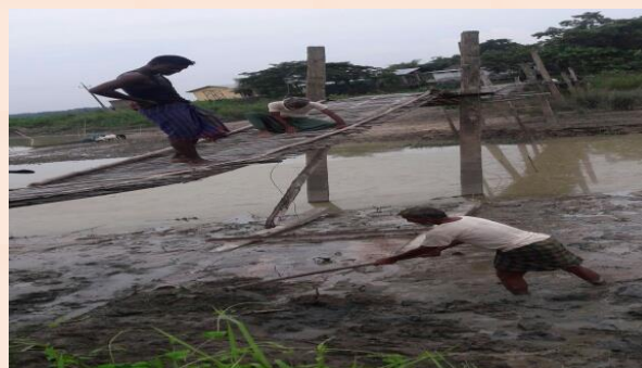
Community people rebuilding their Bamboo Bridge