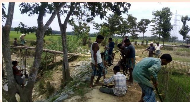
Community working together to rebuild their villages

Some of the pictures by our team on ground: