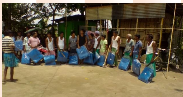
Distribution of the materials to the community workers

NEAID and Goonj tries its best to dignify the relief and rehab work too. People rebuild the lost infrastructure and receive support with dignity. Still there is a long way to go, since millions have lost everything that one need for their basic clothing, utensils, footwear, roof, etc. There is still lot needs to be done. NEAID just have begun by supplying basic material in the form of comprehensive family kits, but in view of winter ahead and rebuilding local infrastructure from roads, water resources, community space, schools and anganwadi, etc. more resources are required to do this work.