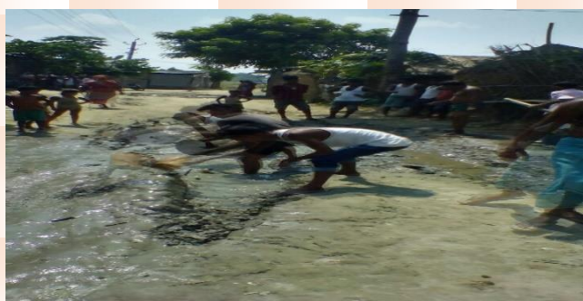
Community workers repairing roads